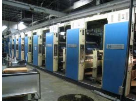
Figure 1 M1000B Printing Press

Due to continued issues with maintaining the TI 560/565-based control system on its M1000 press, the company in 2007 contacted Goss International, who acquired Heidelberg's web press and high-volume postpress business in August of 2004. Goss, in turn, contacted CTI regarding the use of our new 2500 Series™ processor in replacement of the 565.